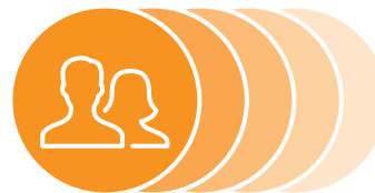
User Community Task Teams (IT, Finance, Engineering, Production, Materials, Service, etc.)

The project will also need an executive sponsor to provide vision, motivation, and conflict resolution (when the team doesn't have the authority to break a stalemate or resource contention issue). Project team participation is seldom a full-time job (except perhaps for the project leader/team leader). Specific tasks will be completed by sub-teams in the individual departments under the watchful eye of task team leaders who report to the project team.